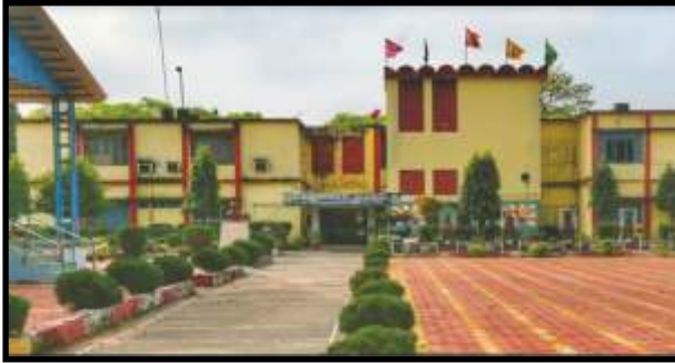
DAV P.S, MCL, J A, DERA, TALCHER