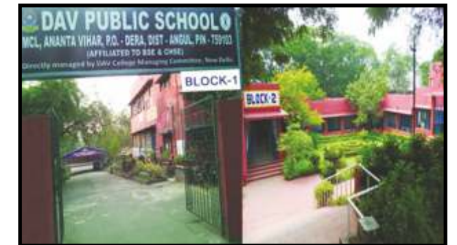
DAV P.S, CHSEO, MCL, ANANTA VIHAR, TALCHER