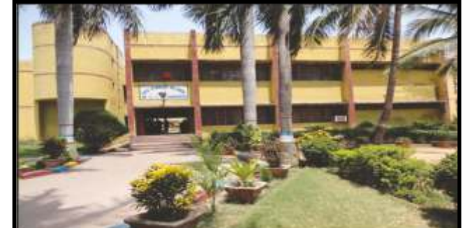
DAV P.S, MCL, LAKHANPUR, BANDHABAHAL