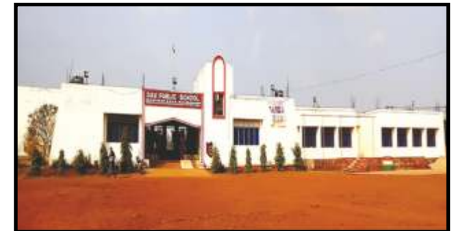
DAV P.S, MCL, SOCP, BRAJARAJNAGAR, JHARSUGUDA