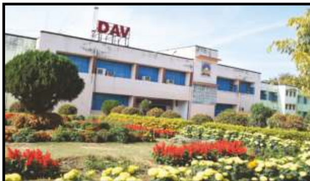
DAV P.S, MCL, ANAND VIHAR, BURLA