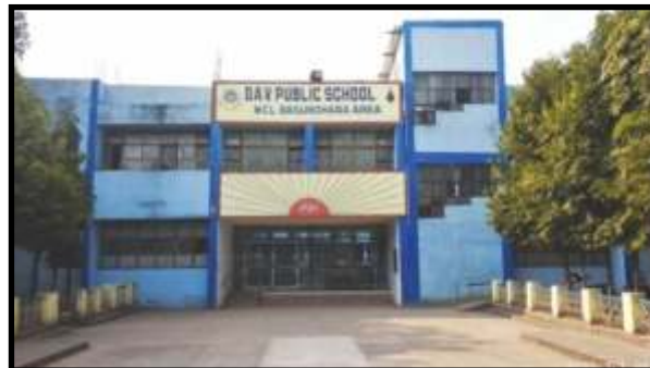
DAV P.S, MCL, BASUNDHARA AREA, SUNDARGARH