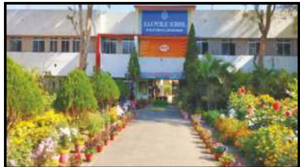
DAV P.S, MCL, IB VALLEY AREA, BRAJARAJNAGAR