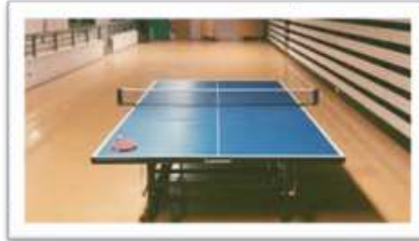
TABLE TENNIS COURT