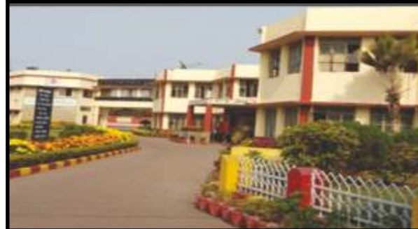
DAV P.S, MCL, KALINGA AREA, TALCHER