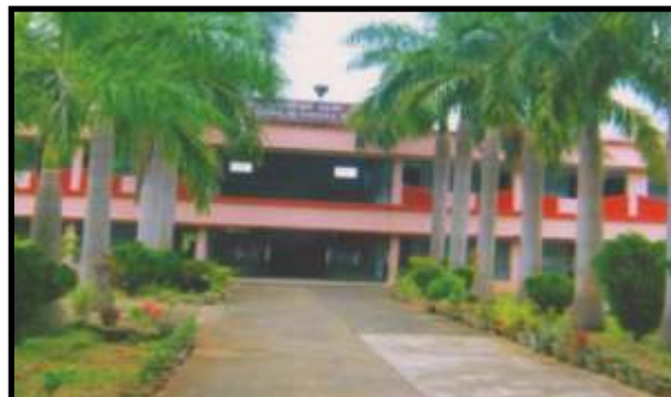
DAV GIRLS' H S, BSEO, MCL, CWS, TALCHER